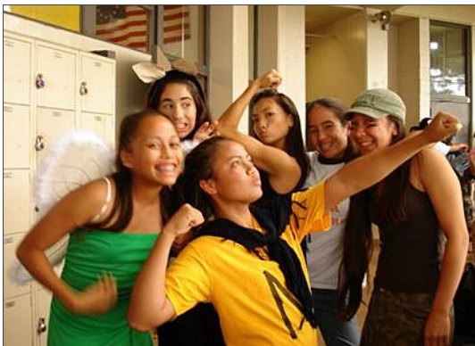
Class of 2009

Shuttle buses will be available to transport guests from the dorms to scheduled Alumni Week campus events. Shuttle schedules will be included in the boarder packets and the Alumni Week program of the week.