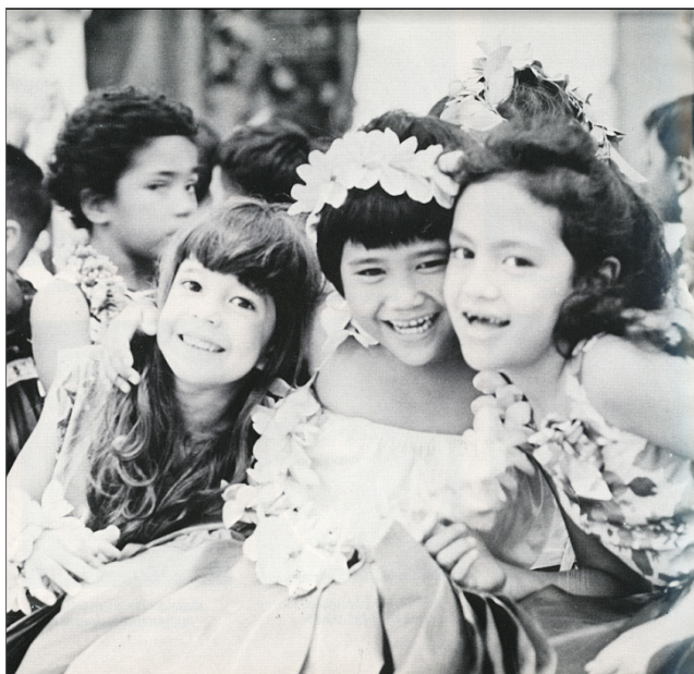
Class of 1979

Two (2) tickets maximum. NO ALCOHOL PERMITTED.