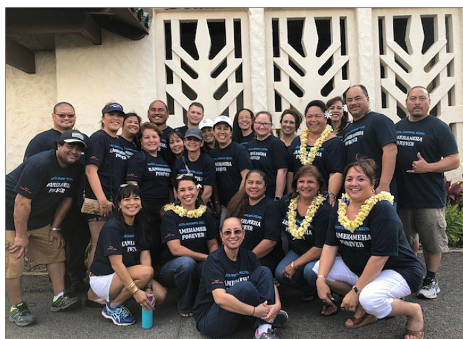
Class of 1984