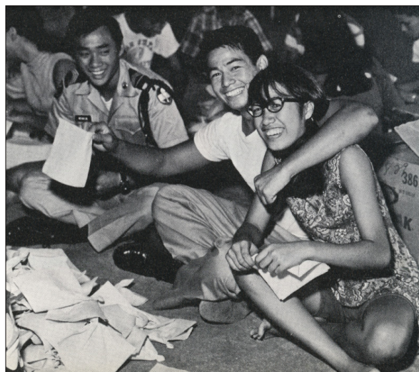
Class of 1969

Register at: http://connect.pauahi.org/2019-ksk-alumni-week-golf