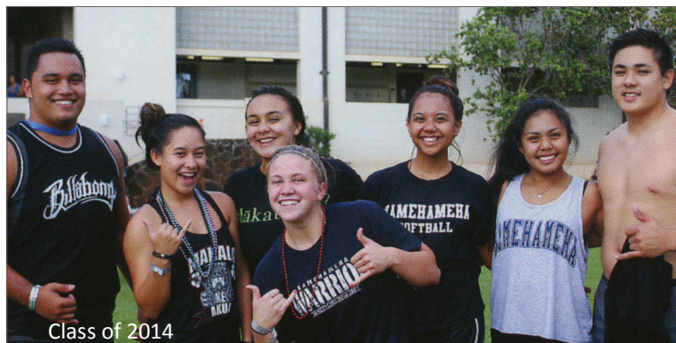
Class of 2014