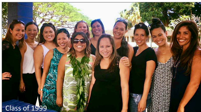
Class of 1999

Join in the fun at the King Kamehameha Celebration Parade. Participants will enjoy reserved seating in bleachers located on the grounds of 'Iolani Palace. Wear blue and white or your class colors and support the parade which honors Princess Pauahi's great-grandfather. Don't forget your sunscreen and papale . The bus will be there to pick you up following the parade so that you can return to campus in plenty of time to get ready for the Alumni Week Lū'au. Ticket required. Two (2) tickets maximum. NO OUTSIDE ALCOHOL PERMITTED.