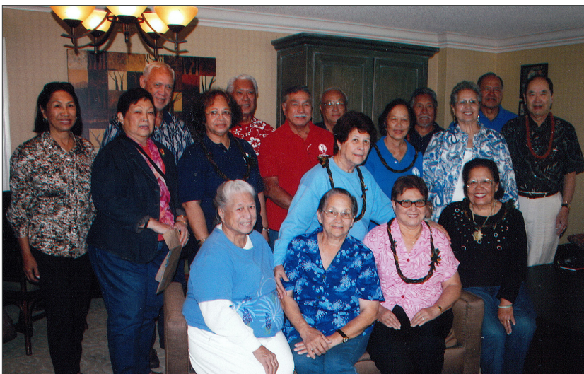
Class of 1954