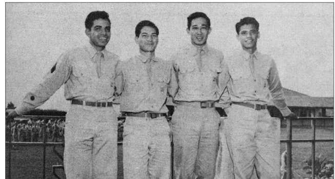
Class of 1949