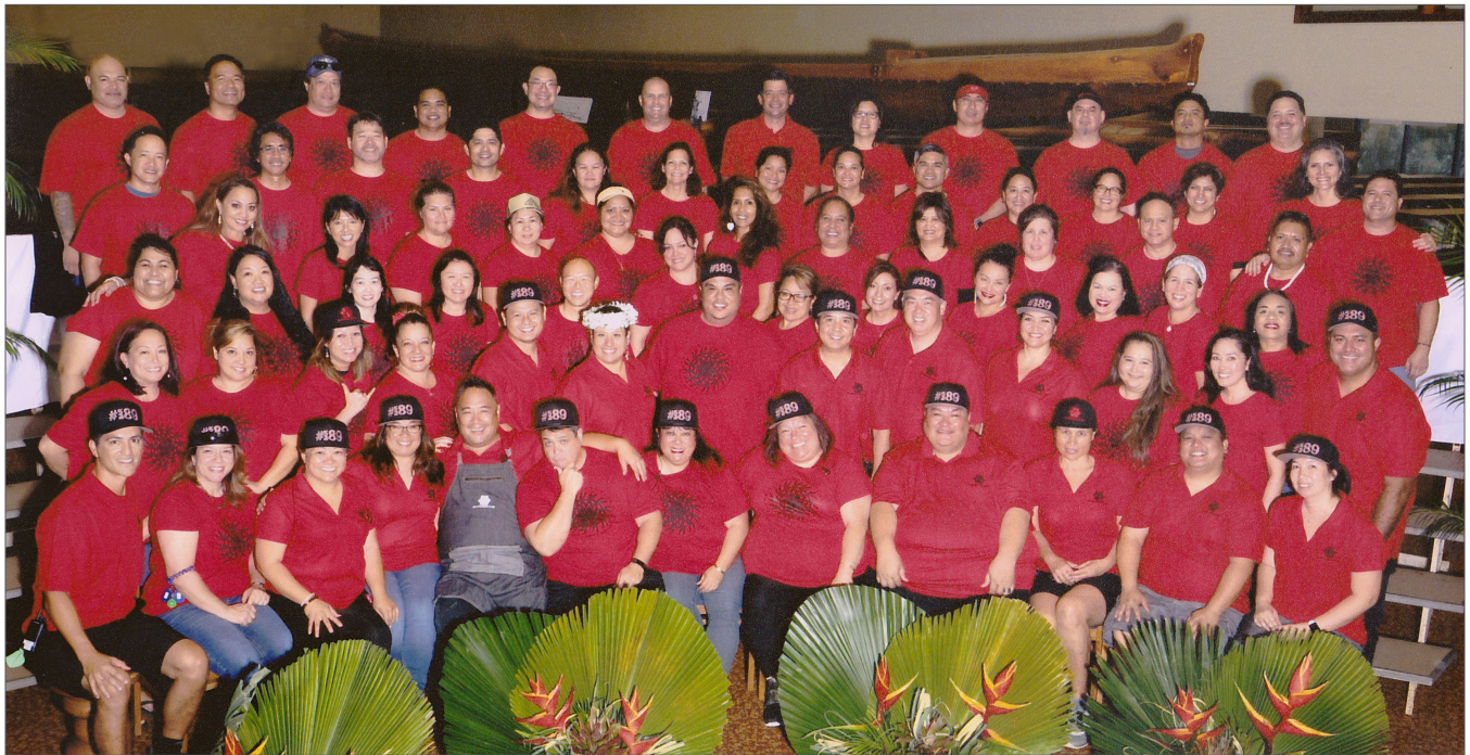
Class of 1989

PRESORTED FIRST CLASS MAIL U.S. POSTAGE PAID HONOLULU, HI PERMIT NO. 419