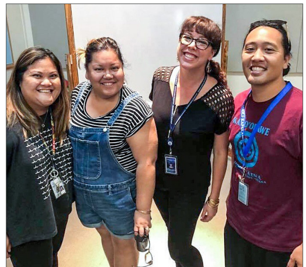
Class of 2004