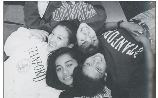
Class of 1994

$21.00 per person Ticket required for entry.