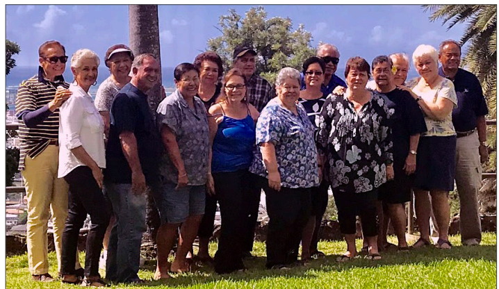
Class of 1964