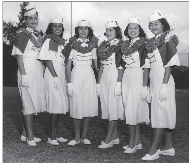
Class of 1959

ALL changes and cancellations will be charged a change fee (determined by transaction cost).