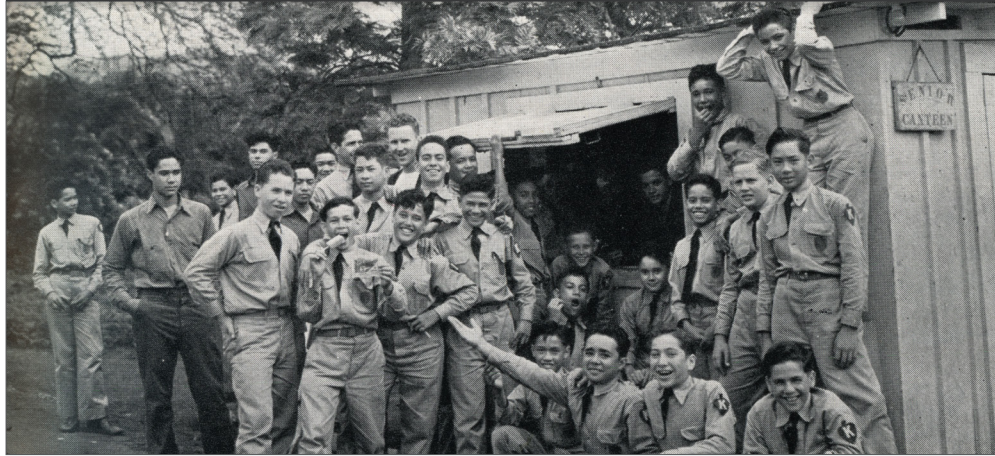
Class of 1944

$16.00 per person Ticket required for lunch.