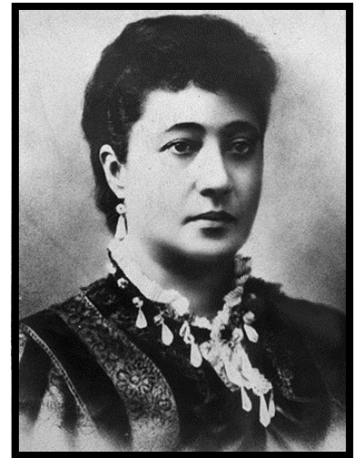
Bernice Pauahi Bishop